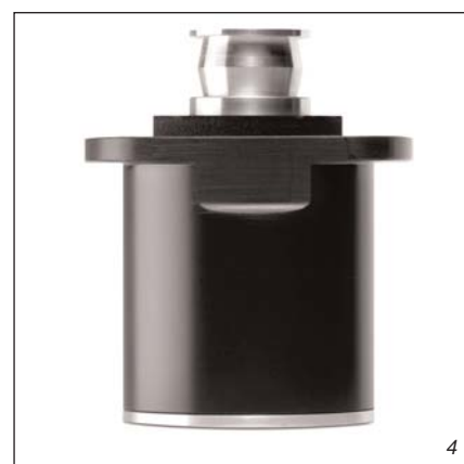
Figure 2 Motor Cap